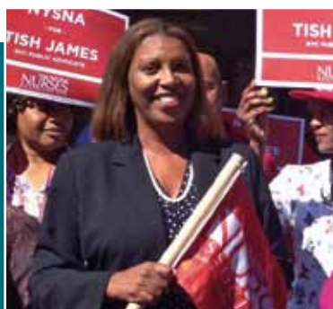
Letitia James for Public Advocate