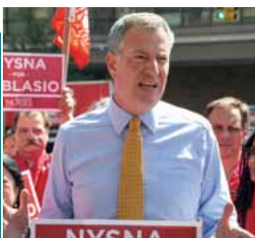
Bill de Blasio for Mayor

NYSNA nurses are taking our demand for quality healthcare for all to the streets and into the halls of political power.