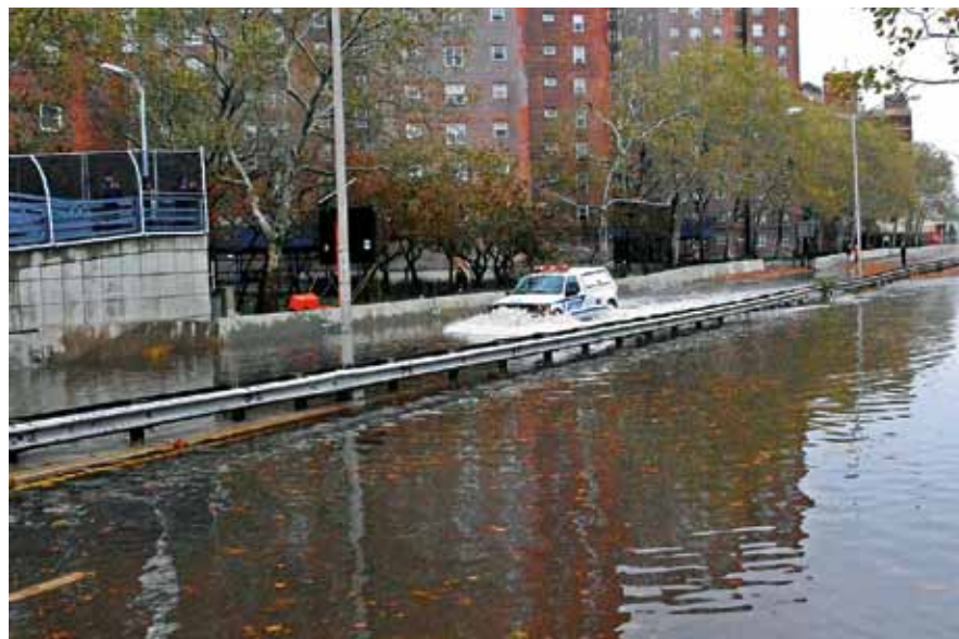
In Hurricane Sandy's aftermath, NYSNA nurses went door-to-door bringing urgent medical attention to thousands of stranded New Yorkers.

We were tougher than the conditions we faced – helping to carry severely ill patients down as many