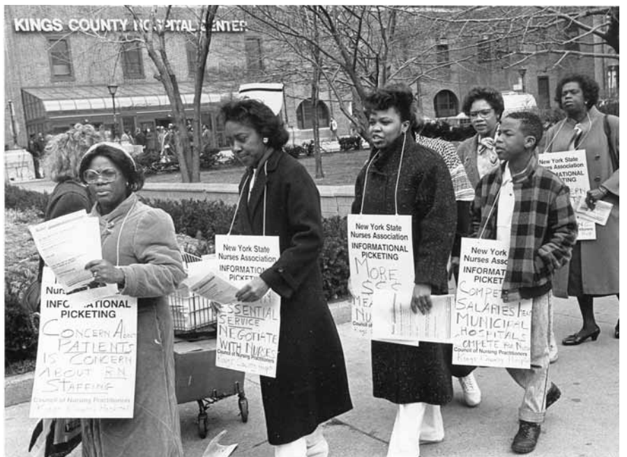
NYSNA nurses have fought for safe staffing and decent pay before, and won. Here, informational picketing at Kings County Hospital in the 1980s.