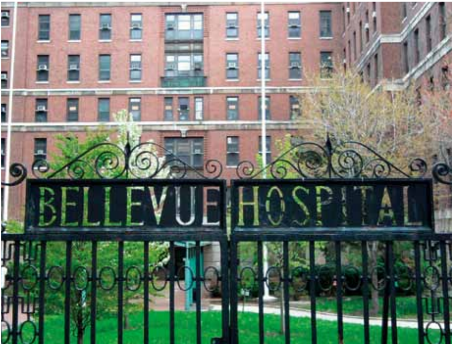
Bellevue is the oldest public hospital in the country.

Discussion about the high and unpredictable cost of healthcare heated up with Steven Brill's eye opening cover story in Time magazine, "Bitter Pill: Why Medical Bills are Killing Us," in early March. He examined how hospitals set exorbitant "chargemaster" prices, which are then dramatically discounted by government