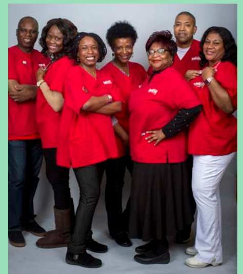
Look for NYSNA Ads Across Brooklyn Calling for Safe Staffing!

While NYSNA and IMC are not yet able to agree on one common contract for OBH, the Bargaining Committee is pleased that work on creating common standards has started. Obviously Safe Staffing and Economic Issues are still outstanding and must be addressed.